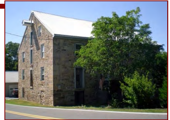
▲ Nissley Mill