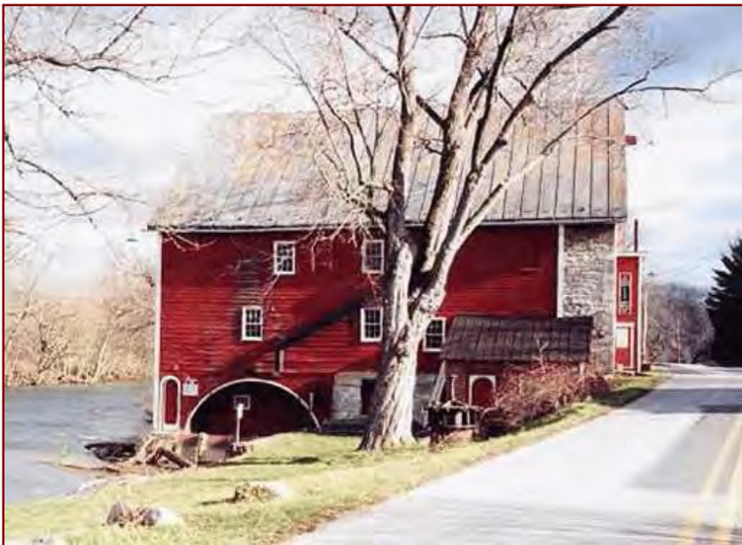
◀ Heishman's Mill