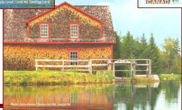
Moulin à farine Riordon | Riordon Grist Mill, Caraquet NB