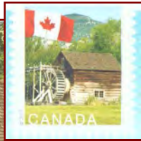
Keremeos Grist Mill | Moulin à blé de