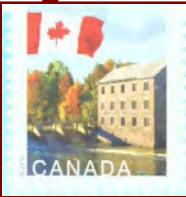
Cornell Mill, Standbridge, QC ►