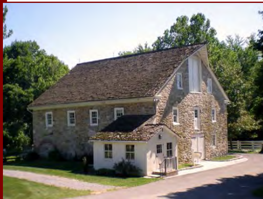
◀ Labata Mill