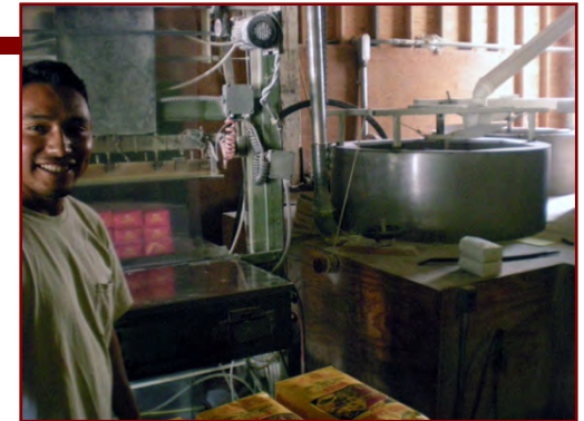
▲ Buffaloe Mill Miller

There was a fish weathervane on the roof of the mill. Fish weather vanes were symbolic requests for prosperity and God's blessing. The present weathervane represents the Roanoke bass fish, or the redeye fish, a rare game fish in the