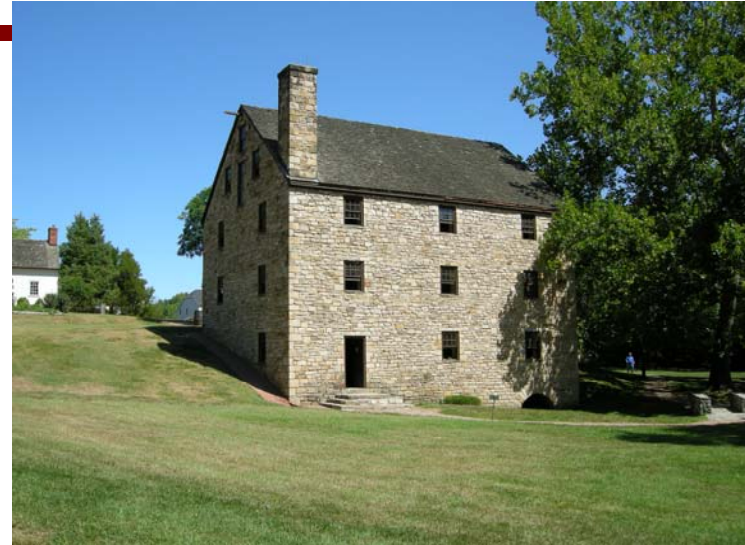
Washington's Grist Mill

The present gristmill building is a recreation of the mill George Washington built and operated for almost three decades. Washington operated the mill during most of his adult life, including his eight years as the first President of the United States. Milling was one of the several enterprises of George Washington. On the ground level of the mill is where the breast-shot water wheel, the master gear, the power gear, and the hub gears are located. Above the gear pit are two sets of millstones. (cont'd...)