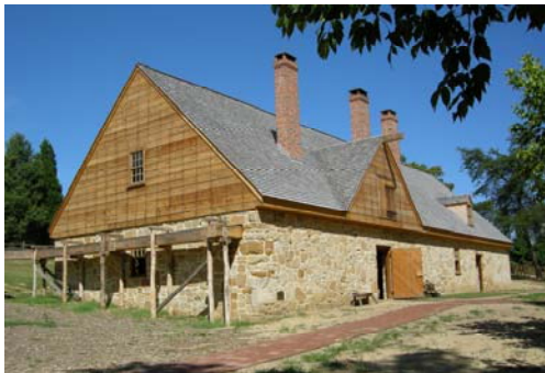
Washington's Distillery

After the lunch, the members were free to either return to the mill and distillery or enjoy exploring the Mount Vernon complex. Since the new George Washington Museum had recently opened, many spent several hours learning new and old tidbits about George Washington.