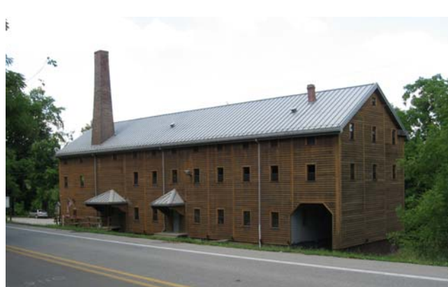
St. Vincent Gristmill