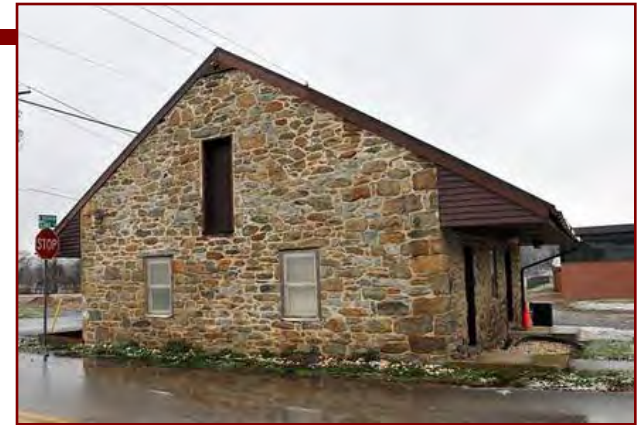
▲ Glades Mill