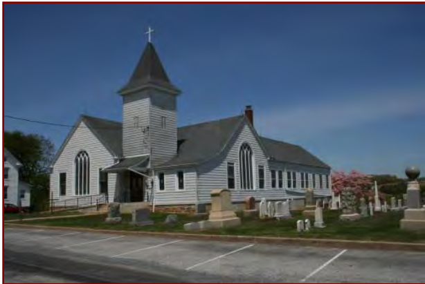
Cross Roads United Methodist Church