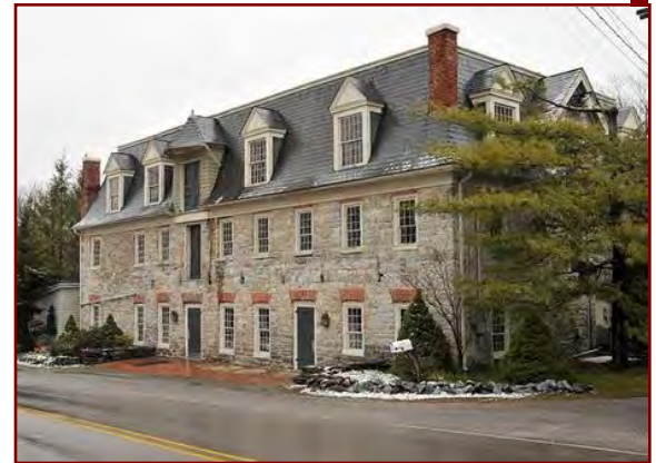
▲ Willow Grove Mill

Mackley's Mill (also Willow Grove Mill) was built on Kreutz Creek in Hellam Township in 1740 by Martin Schultz, who also built the two oldest homes in York County. The 3-story stone-with-frame building, which functioned as a grist and flour mill (Gold Dust brand) and distillery, was powered by two 14-foot wooden overshot waterwheels. The dam and pond are across the street. Pipes ran underground between the house and mill to the wheel in the back of the mill building. The wheels were removed in the 1940s and the mill closed in the 1960s. The building served as a tavern/restaurant and now is a banquet center. The adjacent 18 th -century Mill House is open as the Stone Mill Inn with elegant guest rooms and luxurious accommodations.