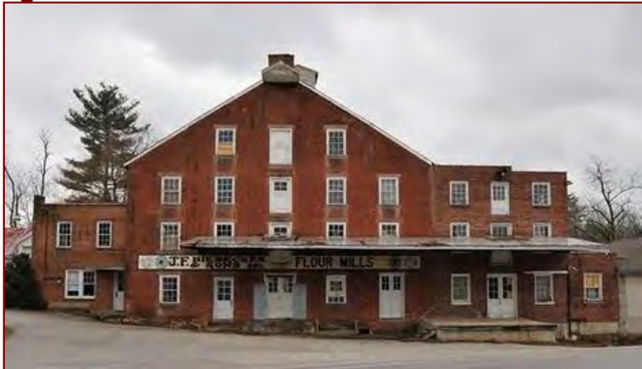
Biesecker's Mill ▼