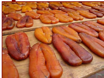
◀ Fresh roe