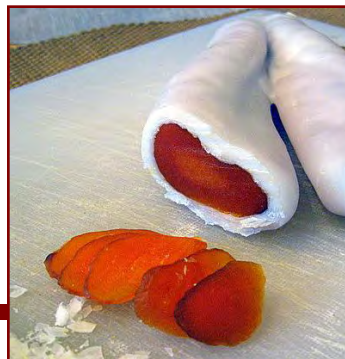
Salt-crusted roe ( bottarga ) ▶